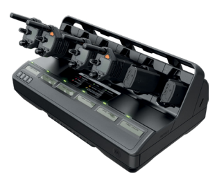
IMPRES 2 Multi-Unit Charger NNTN9115